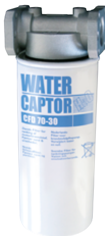
70 L/MIN WATER CAPTOR WITH WATER ABSORPTION