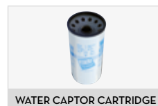
WATER CAPTOR CARTRIDGE