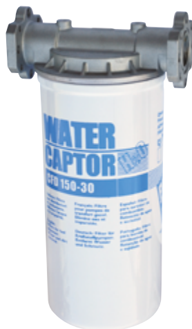
150 L/MIN WATER CAPTOR WITH WATER ABSORPTION